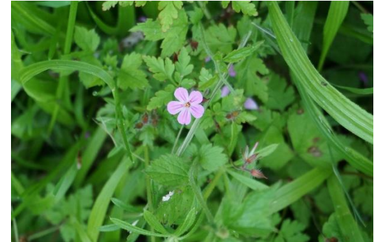
Herb Robert or Little Robin